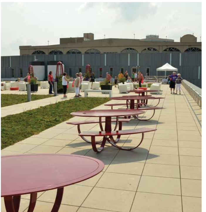
A plaza, modern design, and lots of glass characterize the new Cedar Rapids Downtown Library. It also has the first publicly accessible green roof in the city and has achieved LEED Platinum status for sustainability.