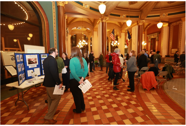
Attendees mingle and learn more about 1000 Friends of Iowa's mission. See more ceremony photos at www.1000friendsofiowa.org